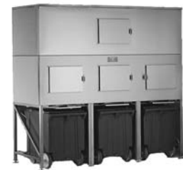
CP3200 Mobile Express Bin