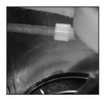
Properly adjusted TXV