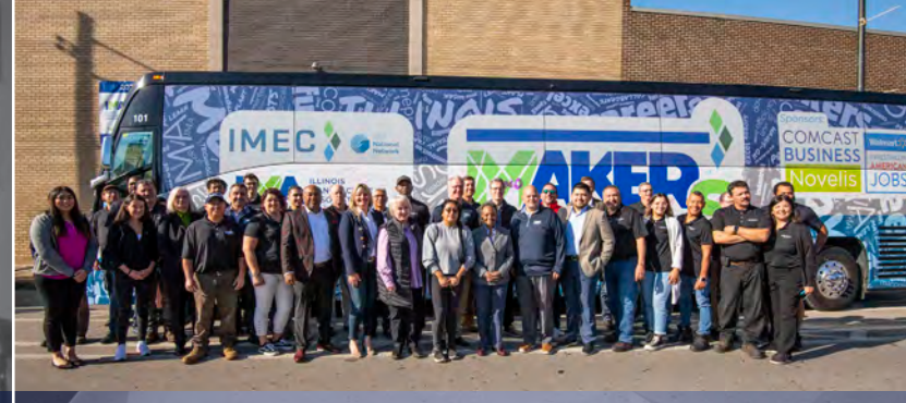
The IMA, IMEC, Chicago Leaders, and employees gather at Howe Corporation to celebrate 110 years in service and 4 generations of leadership during Makers on the Move bus tour stop.