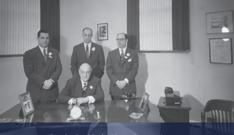
Past leadership for Howe Corporation.