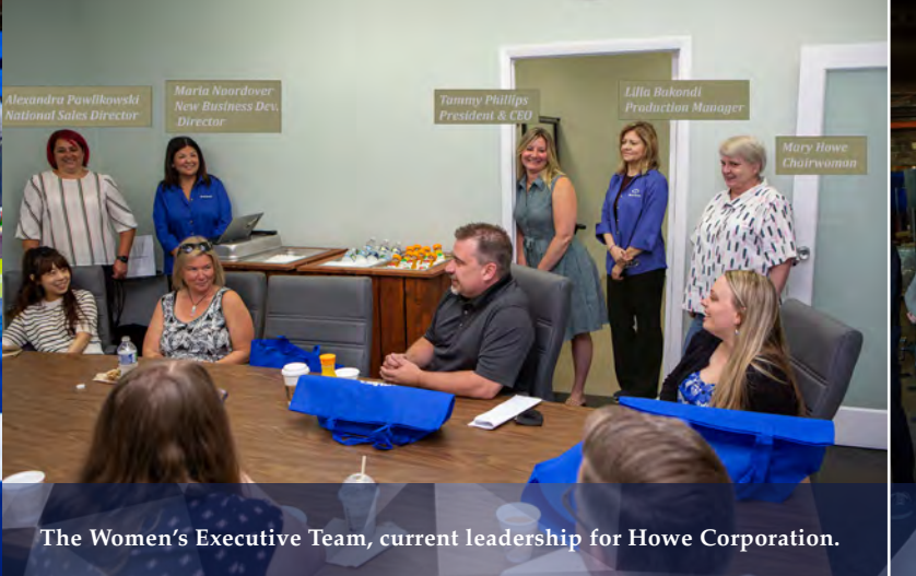
Group of Howe Corporation employees observe the 110 Year Anniversary Celebration during Makers on the Move bus tour stop.

remised if I didn't acknowledge the people. Midwesterners still epitomize unwavering work ethic. The team at Howe is always all hands-on deck and willing to do what it takes to get things done." It is safe to say that Howe recognizes how irreplaceable their employees and community are.